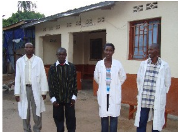
Some of the staff at the AMI Health Center of Buringa